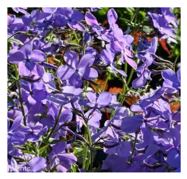
Phlox divaricata "Blue Moon"

After the bluebells, the most popular sellers were either varieties of phlox or ferns. Phlox divaricata 'Blue Moon' realized 63 sales while Phlox subulata 'Emerald Blue' had 54 purchases. Amongst the ferns, Dryopteris marginalis , Marginal fern, and Athyrium felix femina , Lady fern, were the most popular, with 64 and 44 plants sold respectively.