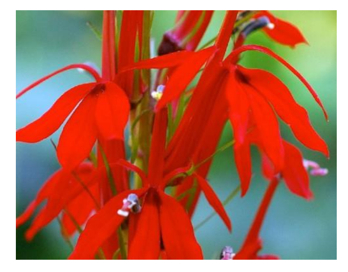
Labelia cardinalis 'Cardinal Flower'

Planners for the 2024 Annual Plant Sale, however, will be taking measures to anticipate some of this year's problems. This includes picking up all plants, especially the bluebells, earlier in the spring, closer to their peak blooming period. Planners will also try to allow extra time for contingencies such as late deliveries.