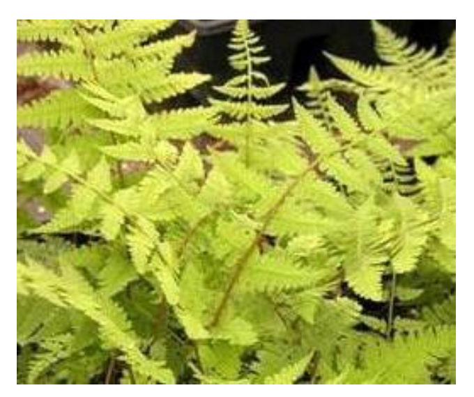
Athyrium felix femina "Lady fern"