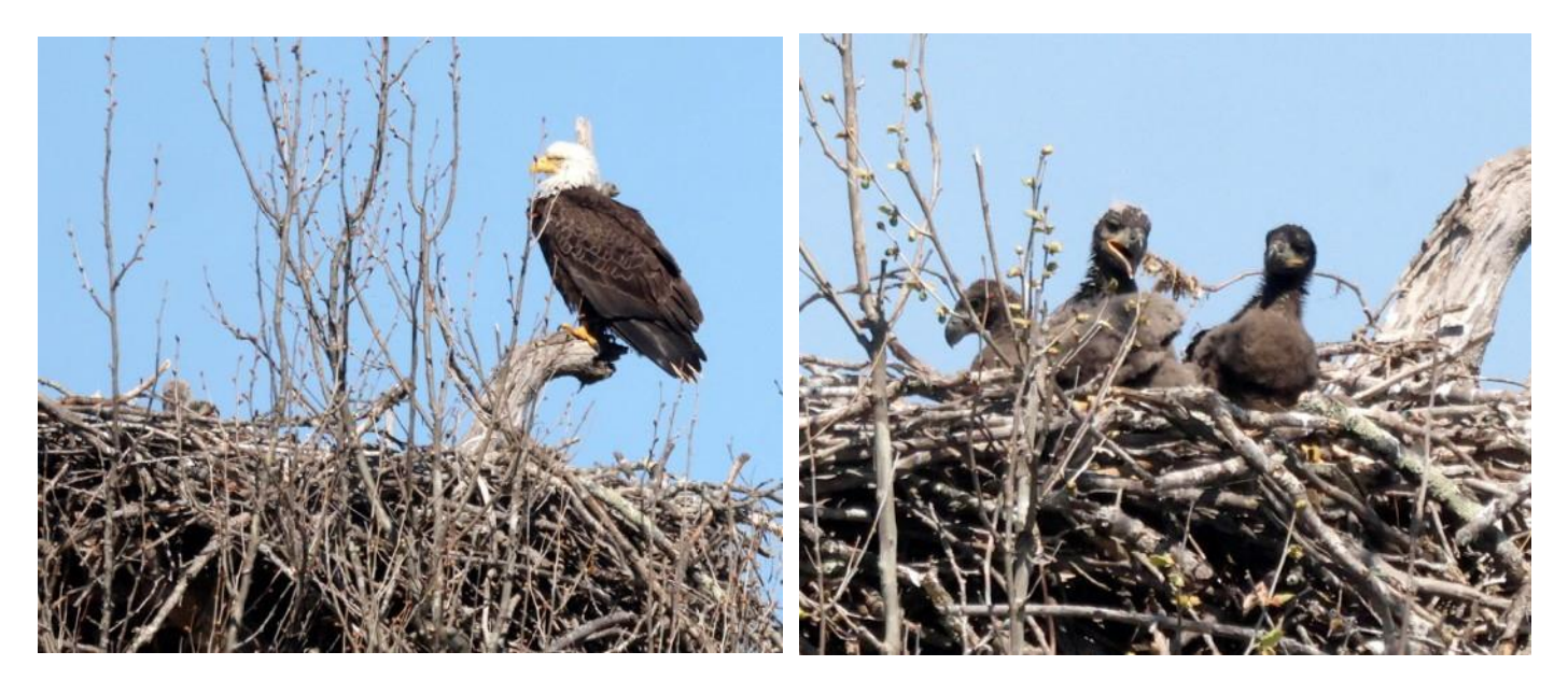
March 23, 2023