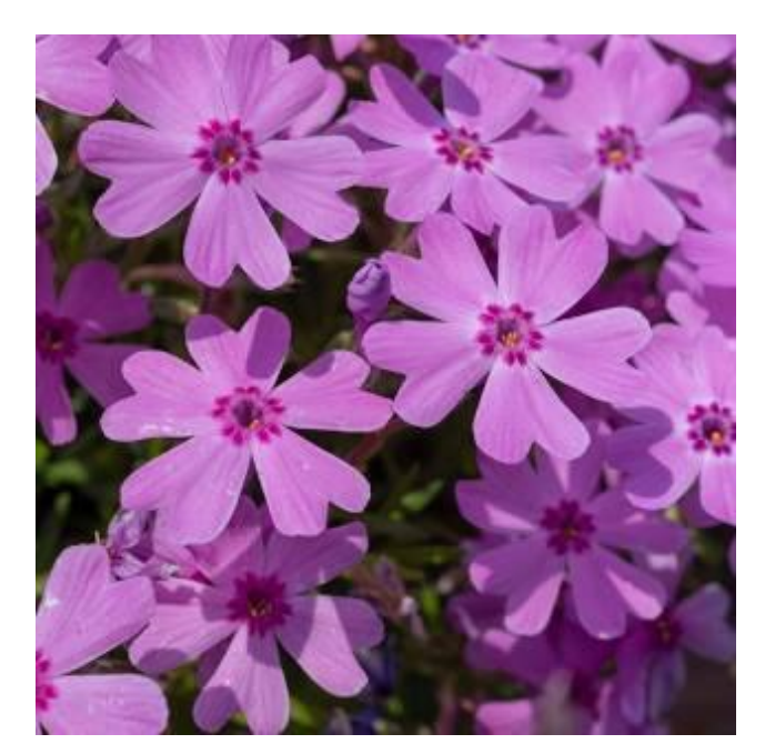
Phlox subulata "Emerald Blue"