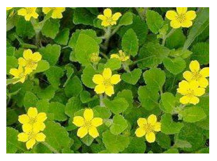
Chrysogonum virginianum 'Pierre'