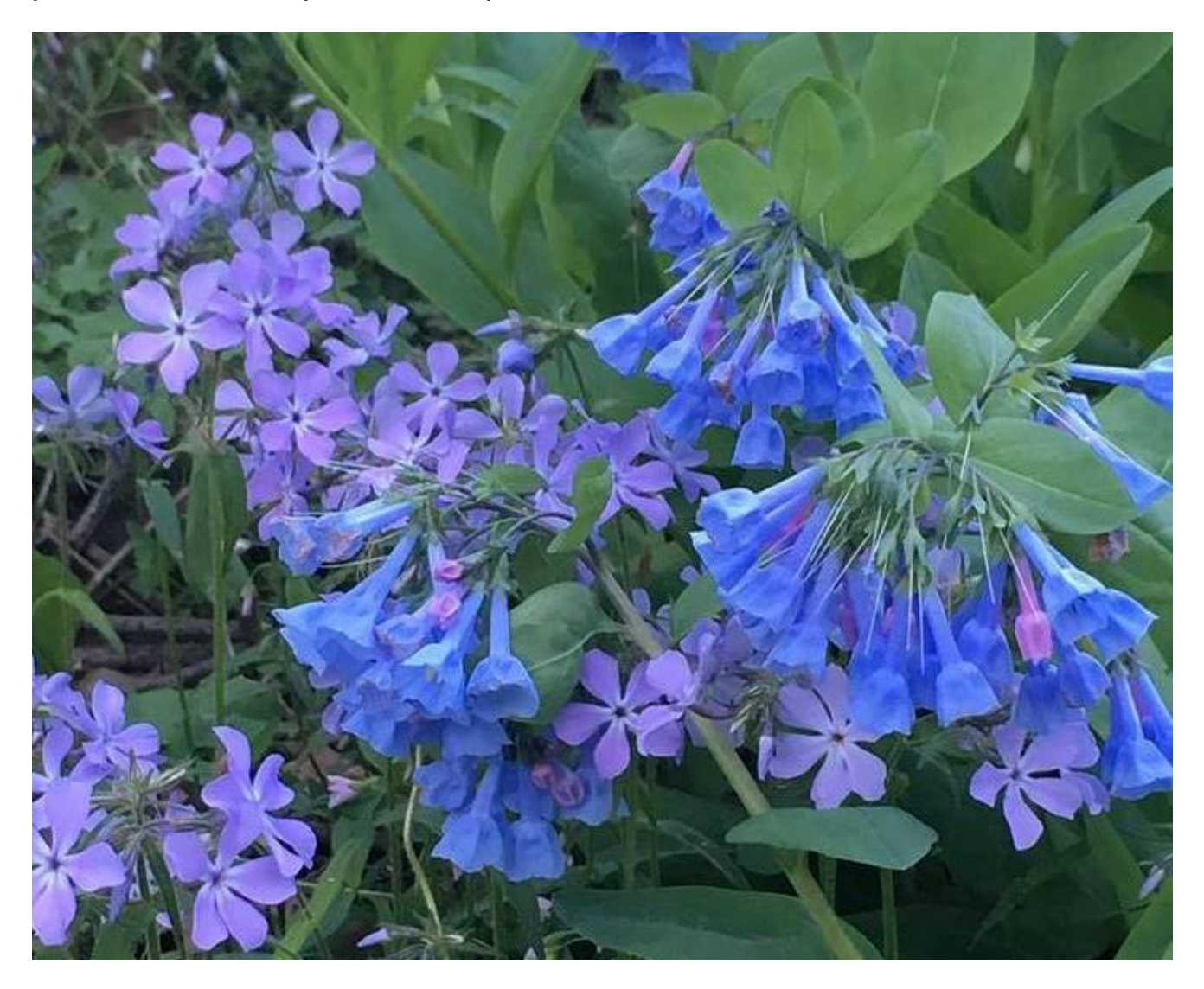
Phlox subulata 'Emerald Blue' and Mertensia virginia 'Virginia Bluebells' at Riverbend Park

For the past 23 years, the Friends of Riverbend Park (FORB) has conducted its annual plant sale for the benefit of Riverbend Park. The sale is coordinated, as much as possible, with Riverbend Park's annual Bluebell Festival and with the peak blooming of the bluebells in late March and early April. This year, a total of 504 bluebell plants were sold, either online from February 1<sup>st</sup> through April 1<sup>st</sup>, at the park's Bluebell Festival on April 8<sup>th</sup>, or through the Women's Club of Great Falls' (WCGF) Bluebells and Bald Eagles event on April 5<sup>th</sup>. Virginia Bluebells were by far the largest seller, with 270 plants purchased online and 234 purchased at the April 5<sup>th</sup> and April 8<sup>th</sup> events.