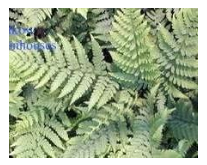
Dryopteris marginalis "Marginal fern"